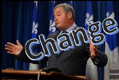
Yves Bolduc – 2014/15

Quebec's idea of stability in education 2010 - 2015