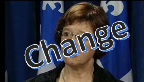
Marie Malavoy – 2012/14

Quebec's idea of stability in education 2010 - 2015